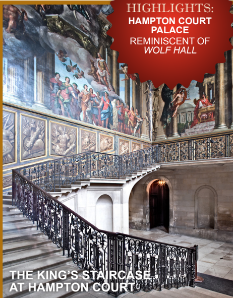
THE KING'S STAIRCASE AT HAMPTON COURT

HIGHLIGHTS: HAMPTON COURT PALACE REMINISCENT OF WOLF HALL