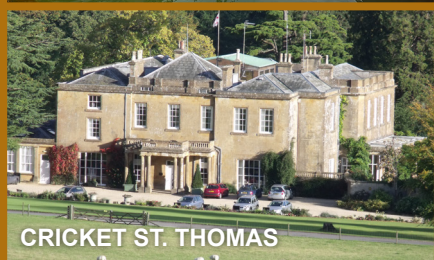
CRICKET ST. THOMAS