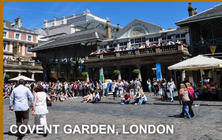
COVENT GARDEN, LONDON