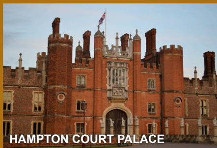
HAMPTON COURT PALACE

After our time at Hampton Court Palace, we will head into Central London (passing some of London's iconic sites along the way) to The Clermont, Charing Cross. Tonight we will dine in style at our farewell dinner in London, where we will toast the great week we just had.