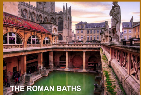
THE ROMAN BATHS