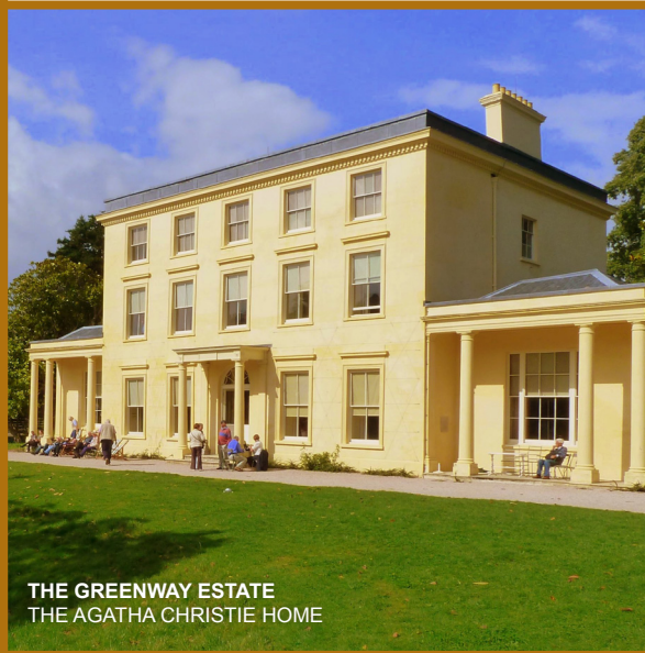
THE GREENWAY ESTATE THE AGATHA CHRISTIE HOME

This afternoon, we'll head to the quaint and picturesque town of Sidmouth on the Devon coast, where you will have some time to shop or walk on the beautiful beach. Tonight, we will dine in style at the beautiful De Vere Tortworth Court.