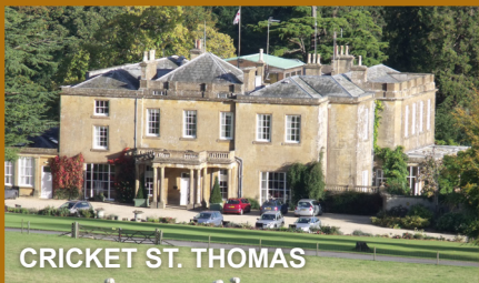
CRICKET ST. THOMAS