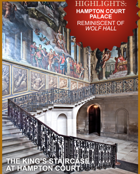
THE KING'S STAIRCASE AT HAMPTON COURT

HIGHLIGHTS: HAMPTON COURT PALACE REMINISCENT OF WOLF HALL