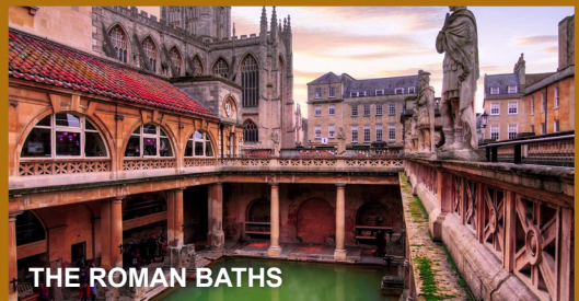
THE ROMAN BATHS