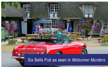
Six Bells Pub as seen in Midsomer Murders

Oxfordshire - Go behind-the-scenes of Midsomer Murders