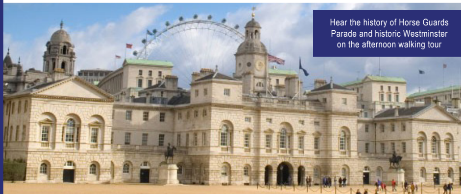
Hear the history of Horse Guards Parade and historic Westminster on the afternoon walking tour