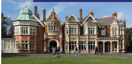
Bletchley Park, home of the WWII codebreakers