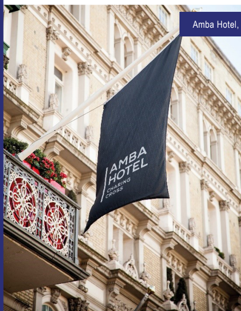
Amba Hotel, Charing Cross