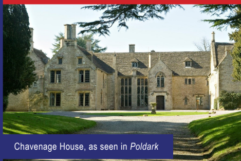
Chavenage House, as seen in Poldark