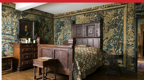
Beautiful interiors at Chavenage House in the Cotswolds