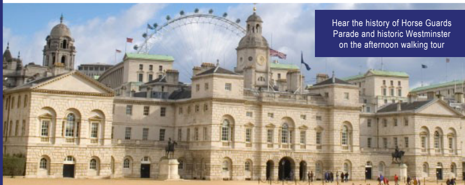
Hear the history of Horse Guards Parade and historic Westminster on the afternoon walking tour