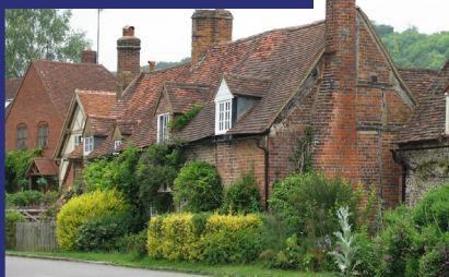
Turville, The Vicar of Dibley village