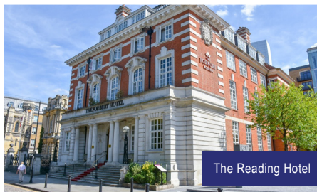
The Reading Hotel