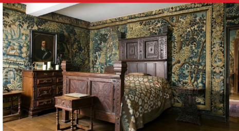
Beautiful interiors at Chavenage House in the Cotswolds