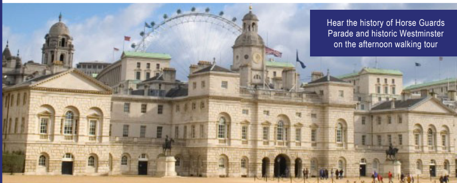
Hear the history of Horse Guards Parade and historic Westminster on the afternoon walking tour