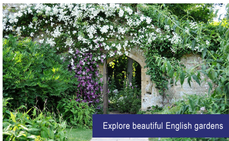
Explore beautiful English gardens