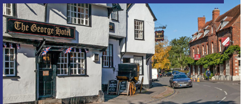
Oxfordshire - Go behind-the-scenes of Midsomer Murders