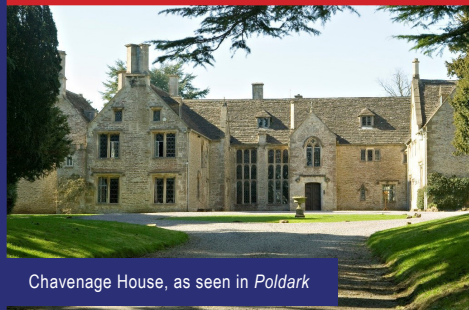
Chavenage House, as seen in Poldark