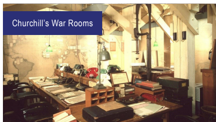
Churchill's War Rooms