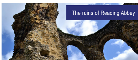
The ruins of Reading Abbey

Today we are off to Oxfordshire, to see many of the sites and villages associated with the classic series Midsomer Murders . Our tour of Dorchester-on-Thames will be led by Midsomer Murders experts, and we will see the sites used in filming, as well as beautiful Dorchester Abbey. For lunch, we will gather at the White Hart Hotel for a delicious group meal, then head to nearby Warborough — a village filled with thatched-roof cottages as well as the Six Bells Pub, where we will enjoy a pint with the locals. Later in the day, you'll have some free time in Reading for shopping or seeing the ruins of Reading Abbey. In the evening, we will dine in our beautiful hotel, The Roseate Hotel, one of the region's most luxurious places to stay.