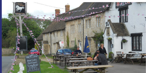
Biddestone, the picturesque backdrop for Agatha Raisin