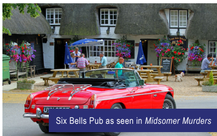
Six Bells Pub as seen in Midsomer Murders