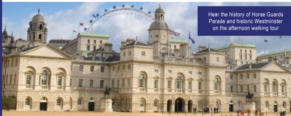
Hear the history of Horse Guards Parade and historic Westminster on the afternoon walking tour