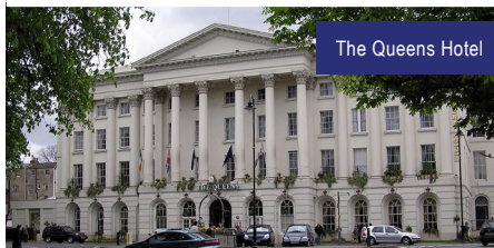
The Queens Hotel