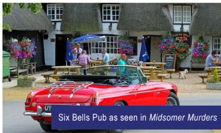
Six Bells Pub as seen in Midsomer Murders

Oxfordshire - Go behind-the-scenes of Midsomer Murders