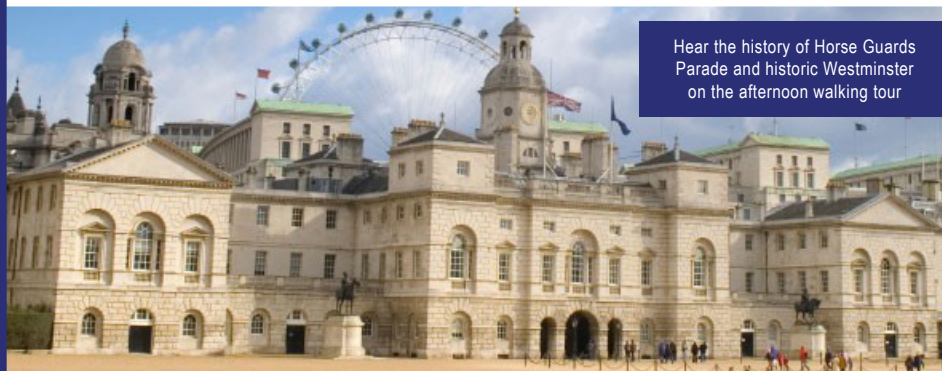
Hear the history of Horse Guards Parade and historic Westminster on the afternoon walking tour